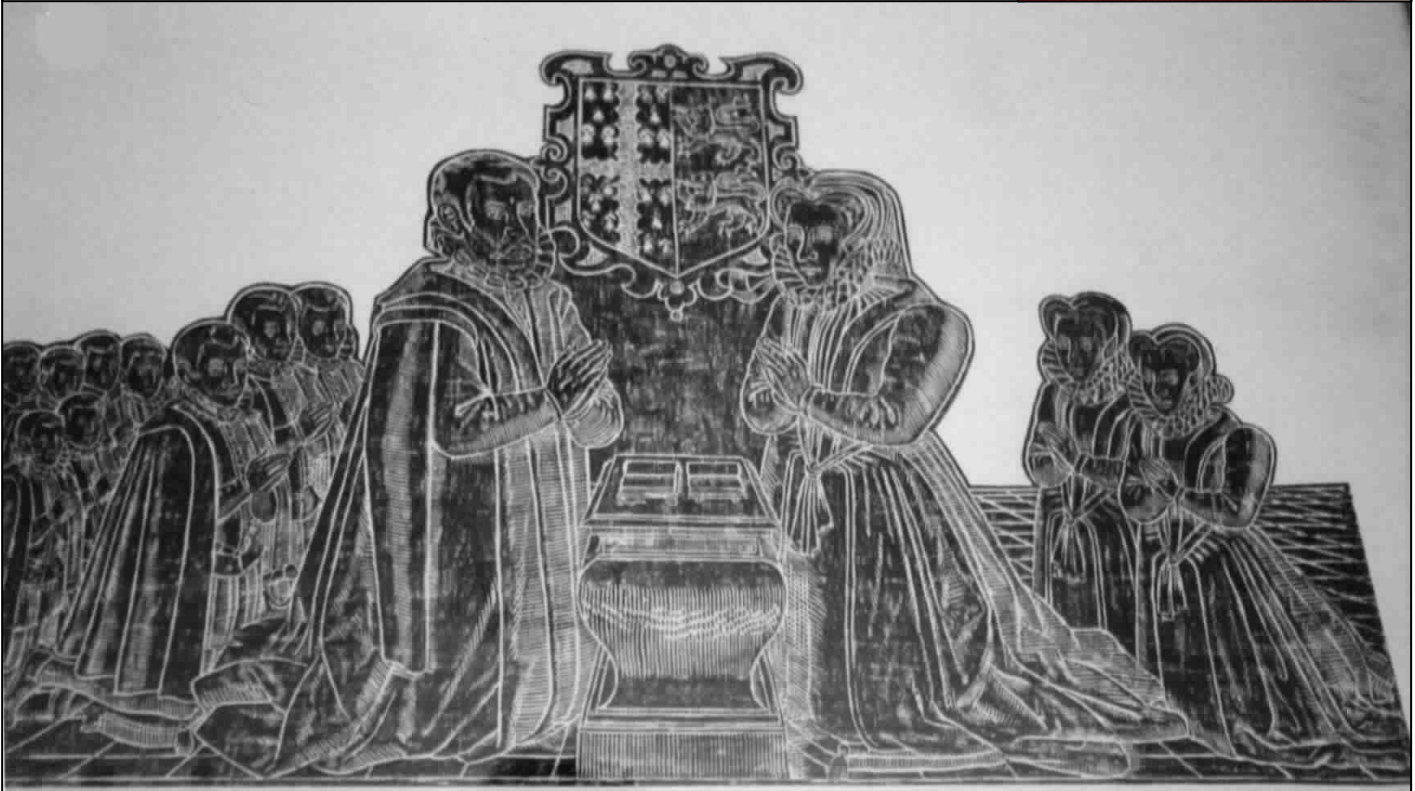
Images (clockwise from top left): The Potteries in Charlton Lane, 1908; Fly jacket of a book written by the Society's founder; "The Norwood Brass" in Leckhampton Church, showing the Tudor dress (rubbing by Amy Woolacott).