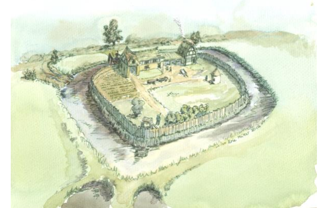
An illustration of how the moated manor house may have appeared

10. You are now back at the Parish Pound, the journey having taken you from Leckhampton in the Dark Ages to the present day.