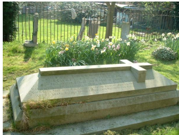
Douglas Gabell's grave in St Lawrence's Churchyard, Swindon Village